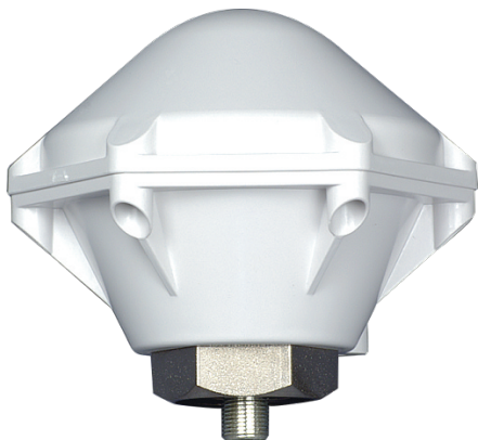
Model AS0087800 GPS Antenna

The active antenna is optimized for GPS. The in-line preamplifier is compatible with existing and proposed L1-band Global Navigation Satellite Systems (GNSS), including GPS, GLONASS, and Galileo; and L1-band Satellite Based Augmentation Systems (SBAS) such as WAAS, EGNOS, and MSAS.