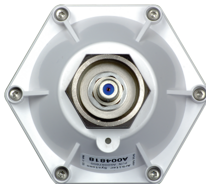
Status LED and Sealed Connector