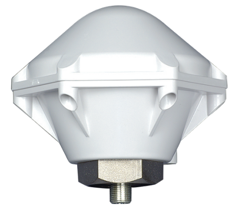
Model AS0099200 GNSS Antenna

Both active antenna and in-line preamplifier are compatible with existing and proposed L1-band Global Navigation Satellite Systems (GNSS), including GPS, GLONASS, and Galileo; and L1-band Satellite Based Augmentation Systems (SBAS) such as WAAS, EGNOS, and MSAS.