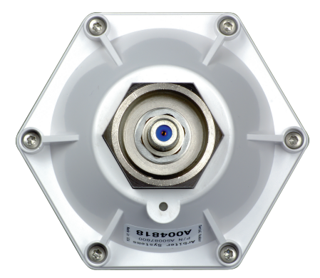
Status LED and Sealed Connector