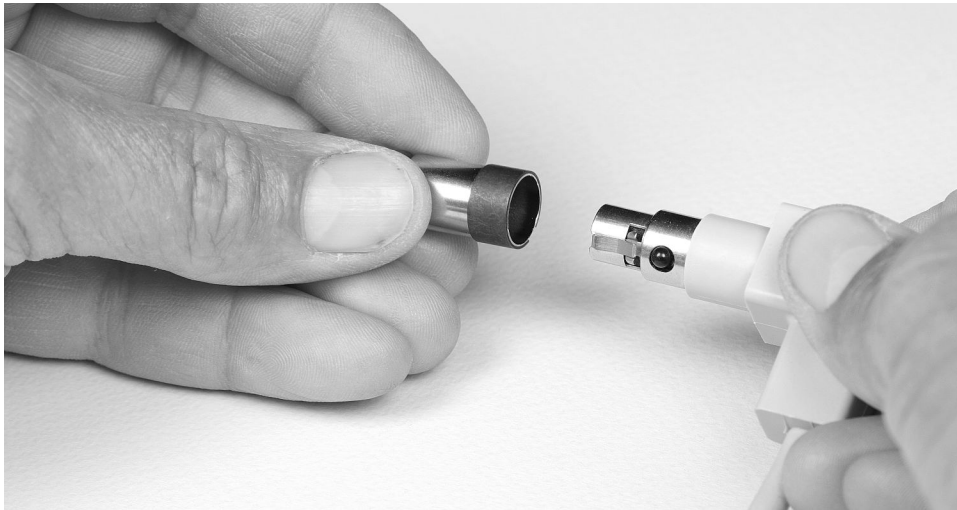
Figure 1: Aligning the Spring Clip and Connector Plug

Begin installation by positioning the shell casing and spring clip as seen in Figure 1. Slip the casing over the small end of the connector plug, as seen in Figure 2.