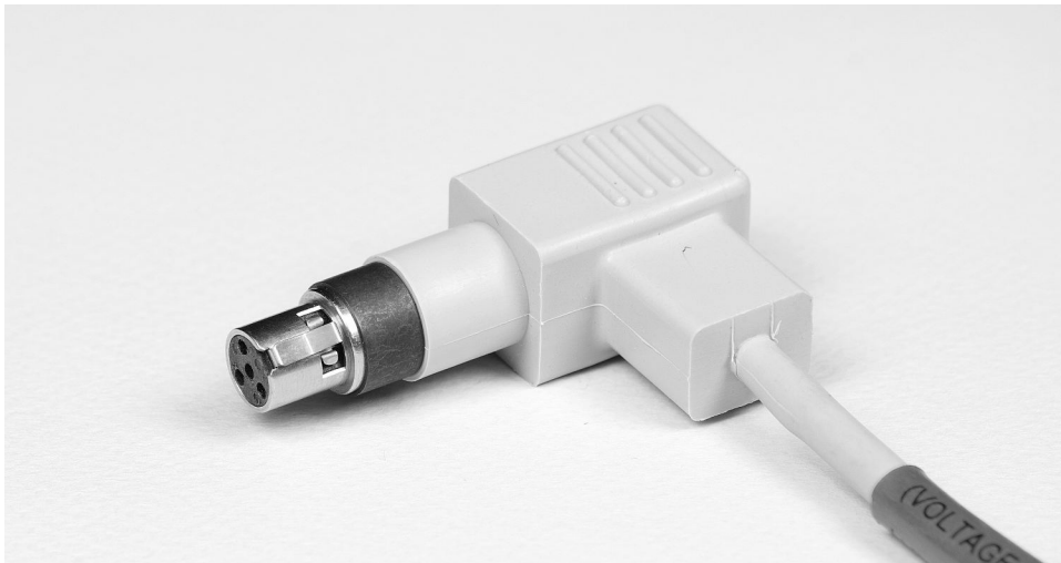
Figure 4: Correctly Mounted Spring Clip

Figure 4 shows the correctly mounted spring clip on the connector plug.