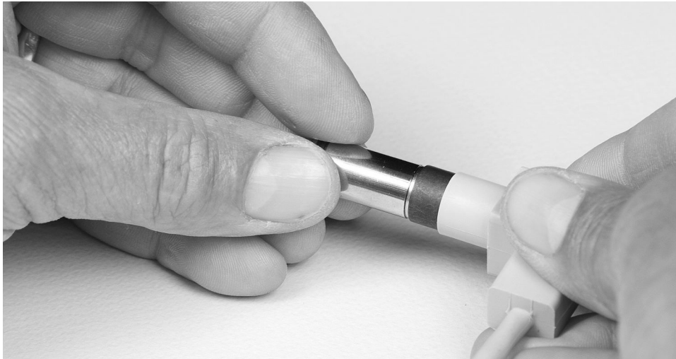
Figure 3: Spring Clip Pressed On to Connector

With your thumb and fingers around the spring clip, slide the spring clip over the larger portion of the connector plug, as seen in Figure 3. It's best if the clip's expansion slot (seen in the cover photo) is not located over the lock button (seen in Figures 1 and 2).